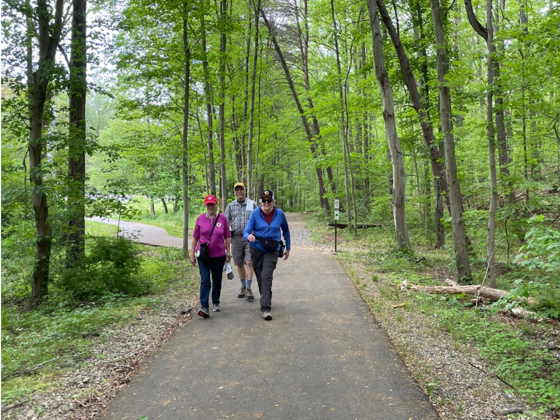
Waltzing along the path to 40 years as a club.