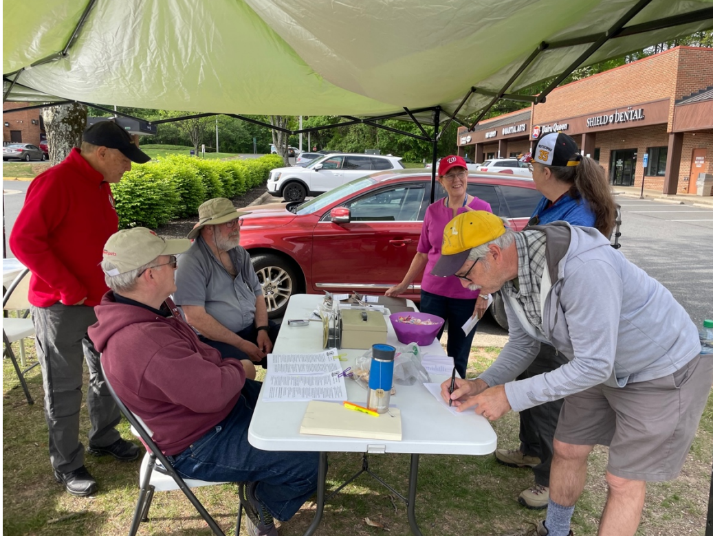
The 40 th Anniversary Walk Table!