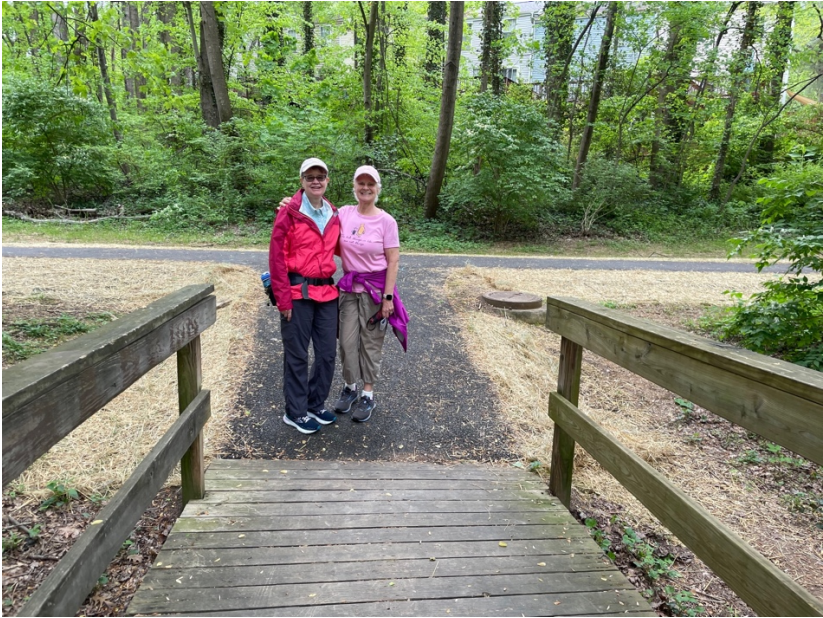
Richmond volksmarchers enjoy the Burke trail.