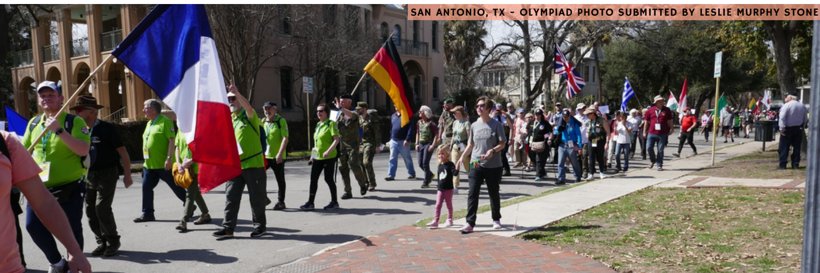
SAN ANTONIO, TX - OLYMPIAD

I already have 44 people who are interested in this trip. If you are interested, please email me at sueammed@aol.com .